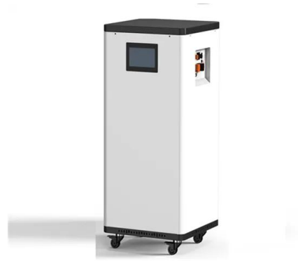
Item # SBE1000. 1000 kWh Battery Energy Storage System On ...

Generac's SBE battery energy storage system is our latest addition to a portfolio of products and technologies helping commercial and industrial customers to meet their current and future energy goals.