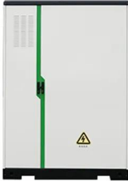
ABB ACS550-01-023A-4 Inverter Malaysia ABB INVERTER ABB ...

SJT SUCCESS INDUSTRIAL AUTOMATION SDN. BHD. - ABB ACS550-01-023A-4 Inverter Malaysia ABB INVERTER ABB Klang, Selangor, Kuala Lumpur (KL), Malaysia Industrial Electronic Machine, ...